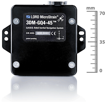
3DM-GQ4™-45-compact, tactical-grade, all-in-one navigation solution with integrated GNSS and magnetometers, high noise immunity, and exceptional performance

The LORD Sensing family of industrial and tactical grade inertial sensors provides a wide range of triaxial inertial measurements and computed attitude and navigation solutions.